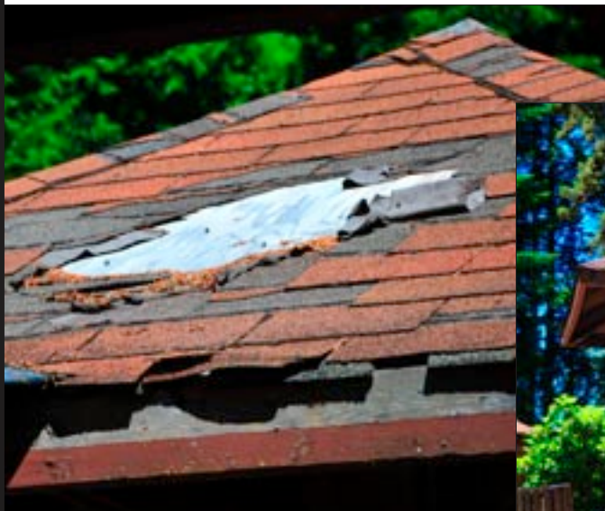
Madrona Beach Cabaña