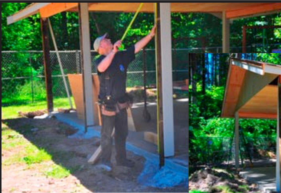
New Ball Field Picnic Shelter