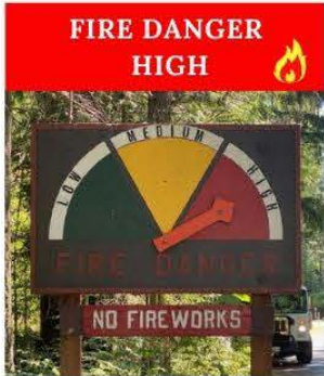
CCA FOLLOWS DNR BURNING RULES. CCA may enforce a total burn ban if deemed necessary.

Fire Safety Burn Ban In Effect The Thurston County Outdoor Burn Ban is effective as of 3 p.m., Thursday, June 24, 2021, and ending Thursday, September 30, 2021. The Fire Safety Burn Ban applies to residential yard waste burning and all land clearing burns. The use of charcoal briquettes, gas, and propane barbeques, as well as recreational fires on private residential properties are allowed. Recreational fires must be contained in approved concrete, stone or metal pits like those commonly found in campgrounds.